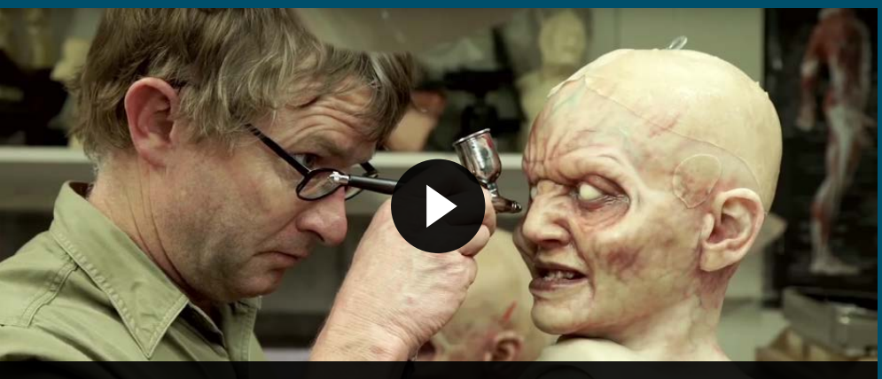
Watch a video about Main Reactor

Main Reactor's current focus are opportunities in the global medical industry - particularly for their world-leading work on prosthetics which has attracted the interest of the University of Auckland. ATEED's international investment specialists have helped connect Main Reactor with potential overseas markets for this new venture.