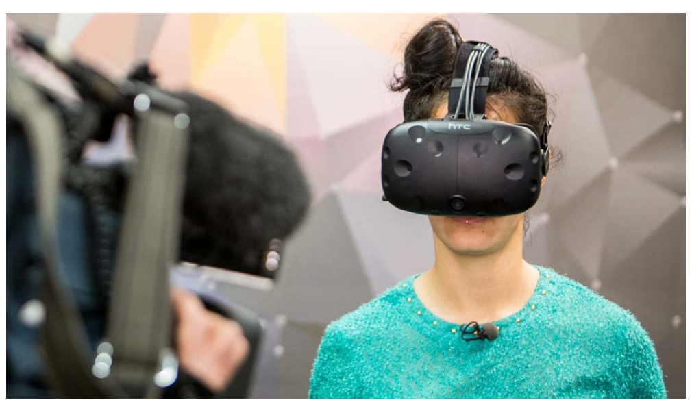
Left AR/VR Garage