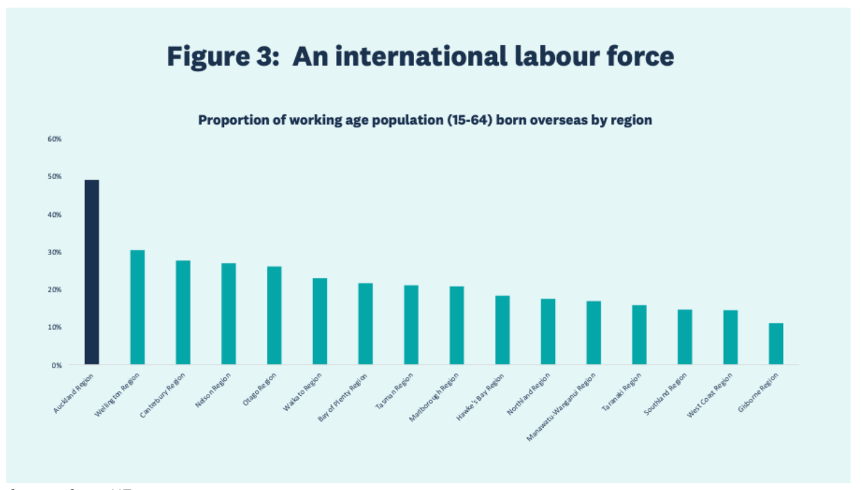
Figure 3: An international labour force