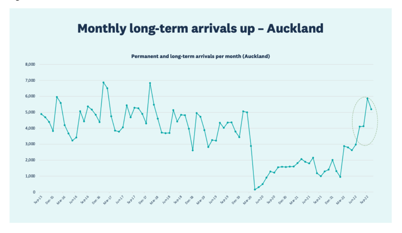
Figure 5: Labour shock

Migrant arrivals, which had supported growth through bringing both talent and capacity to the economy, shifted to a net negative position across 2019 to 2022. While domestic demand was down during this period, as demand has ramped up this has led to significant labour shortages.