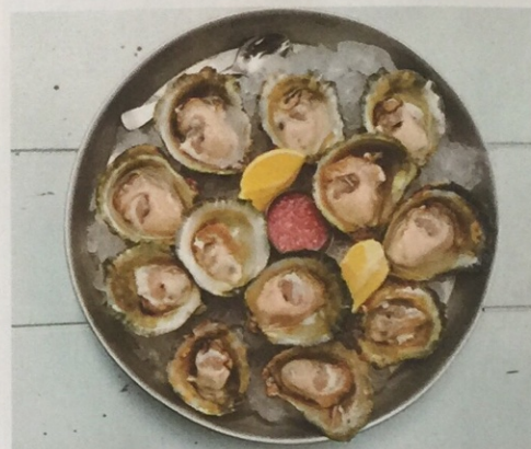
From top: Bluff oysters at the Oyster Inn; one of Waiheke Island's many hidden beaches

in their own backyards. Soon, contemporary sculptures began dotting the coastal bush environment, and more than 30 wineries cropped up, specializing in Bordeaux-style blends and Syrahs. And while it's true that baches (traditional Kiwi beach cottages) have begun to give way to mansions, the island still feels delightfully trapped in time. That means barely any traffic lights, no fast food restaurants, and residents who trap their own rainwater. The locals wouldn't have it any other way.